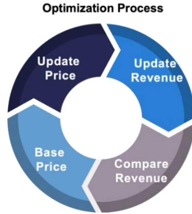
Fig. 2. Optimization Process

which was obtained from the predictive model. The expected revenue at each step is E(\text{Revenue})_t which was compared to the expected revenue at the last step E(\text{Revenue})_{t-1} . The iteration would stop when the increase of revenue between two steps is less than 0.4.